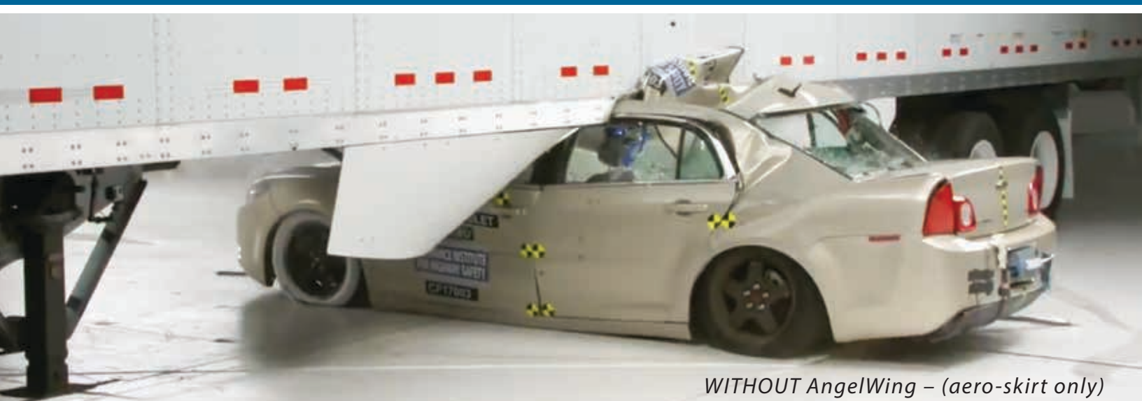
WITHOUT AngelWing – (aero-skirt only)