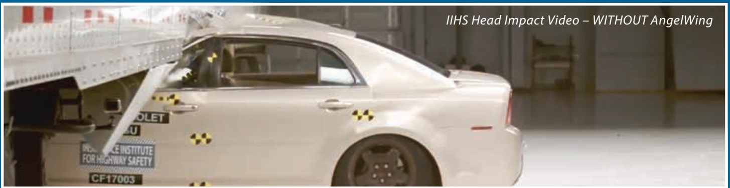
IIHS Head Impact Video – WITHOUT AngelWing

Side underride guards are recommended by the Insurance Institute for Highway Safety (IIHS) and by the National Transportation Safety Board (NTSB). Their data shows that of the serious or fatal injuries caused by impacting the side of a semi-trailer, 89% are considered injuries that could have been mitigated by an AngelWing ® . In crashes without an AngelWing ® a car's bumper will "underride" the trailer, bypassing the car's airbag mechanisms often resulting in crippling or fatal injury to the vulnerable head and neck area of the passengers (photo below). Don't let this happen. AngelWing ® is available now.